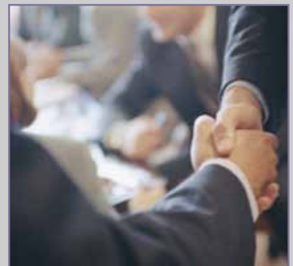
...And generate sales both online and at the event