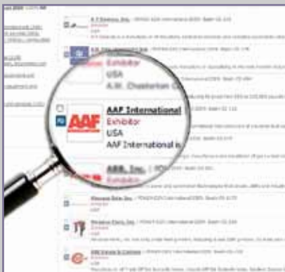
Your profile appears within the community